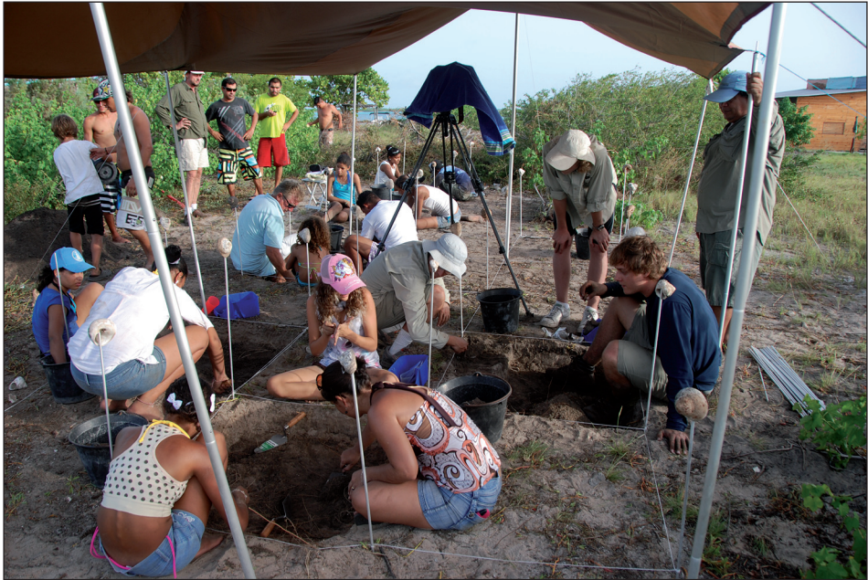
Figure 7. Krasky Archeological Workshop 2011