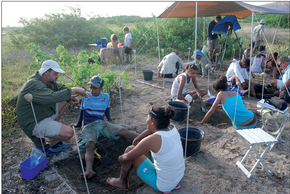
Figure 6. Krasky Archeological Workshop 2011