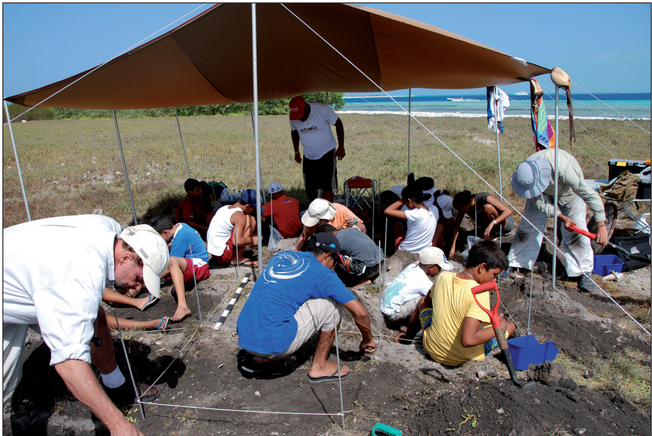
Figure 4. Gran Roque Archeological Workshop 2009