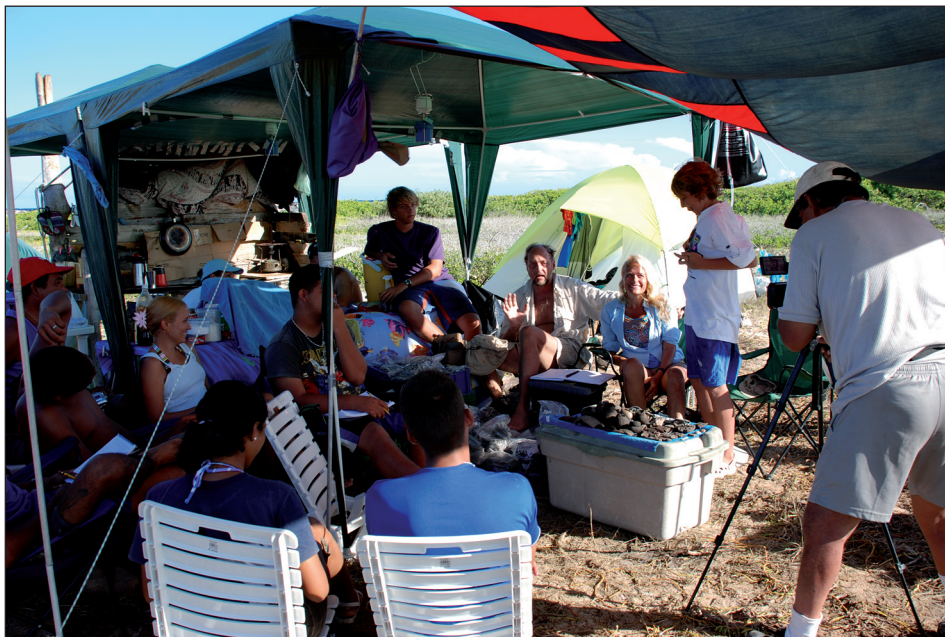
Figure 2. Boca de Sebastopol Archeological Workshop 2007