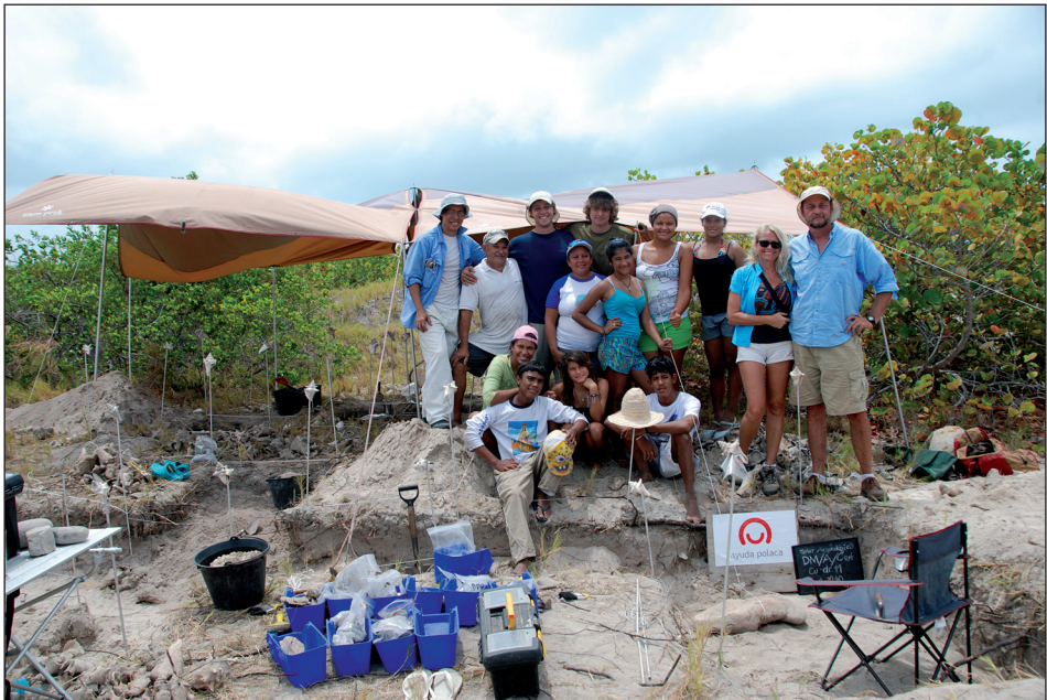
Figure 8. Dos Mosquises Archeological Workshop 2012