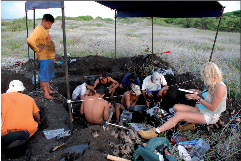
Figure 3. Boca de Sebastopol Archeological Workshop 2007