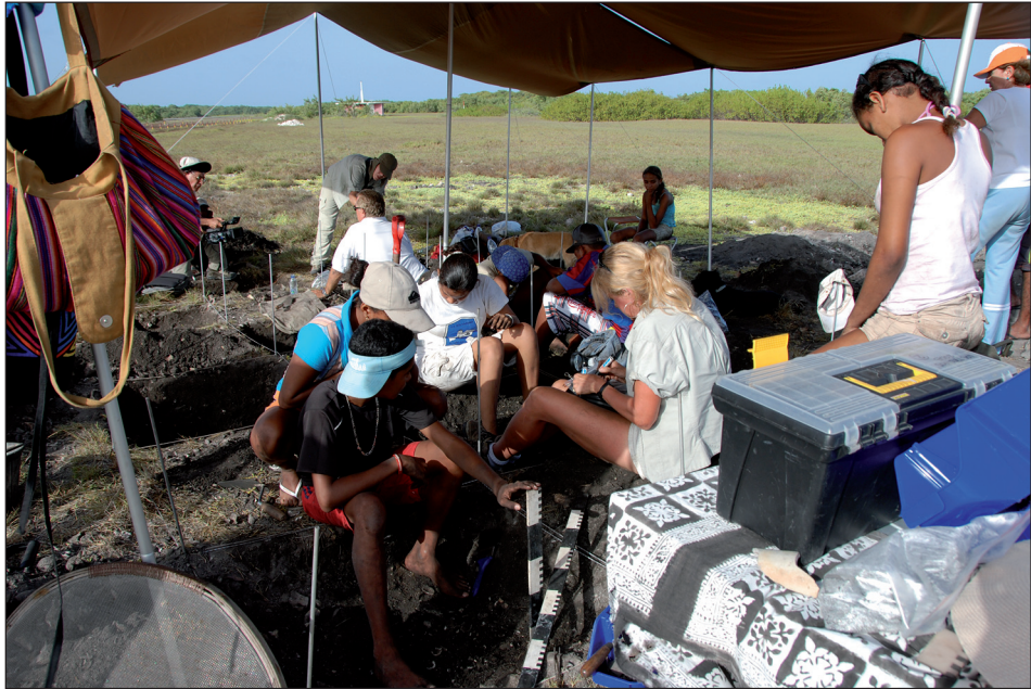
Figure 5. Gran Roque Archeological Workshop 2009