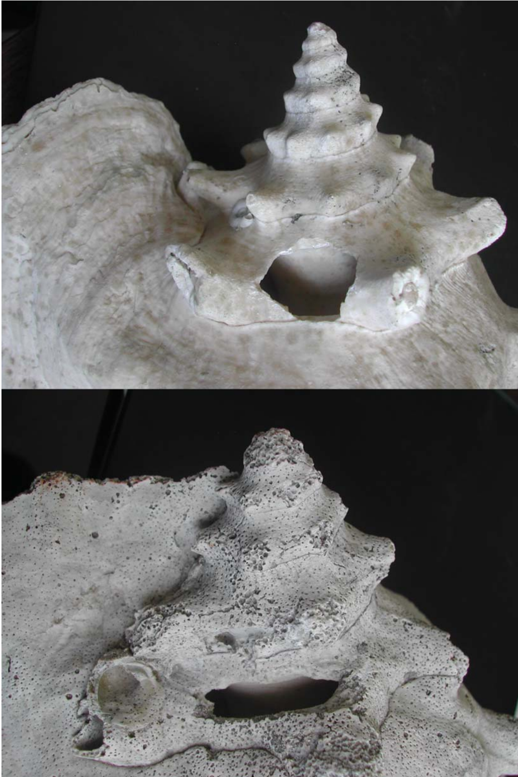
Figure 3: Two main types of opening holes used in the processing of Strombus gigas mollusks: (top) pre-Hispanic circular 'perforation'; (bottom) elongated hole left by the metallic tool.