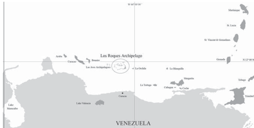
Figure 1: Location of the Los Roques Archipelago within the Caribbean.

archaeological mollusks have to be exhaustively analyzed and discussed to assure the success of these discriminatory processes.